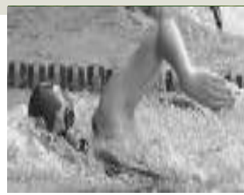
MARINERS REGISTRATION NOON-4 P.M.