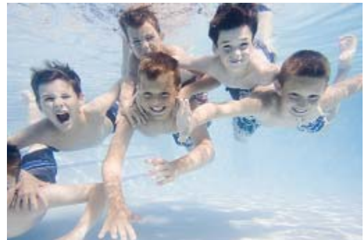
And parents – children playing in the water make noise. When they get quiet, you get to them and find out why.

Sometimes the most common indication that someone is drowning is that they don't look like they're drowning. They may just look like they are treading water and looking up at the sky. One way to be sure? Ask them, "Are you alright?" If they can answer at all – they probably are. If they return a blank stare, you may have less than 30 seconds to get to them. And parents – children playing in the water make noise. When they get quiet, you get to them and find out why.